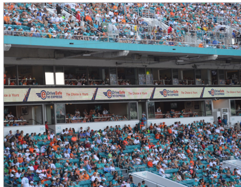
Dolphin Stadium LED Board