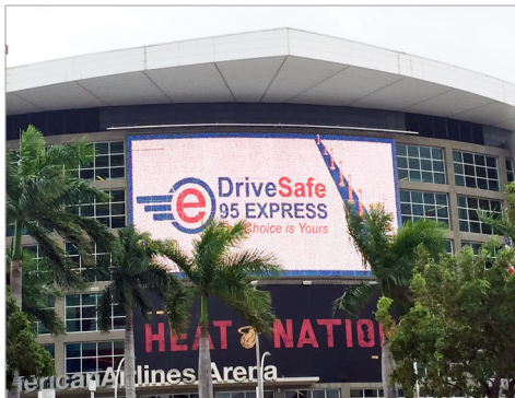
American Airlines Arena Media Mesh